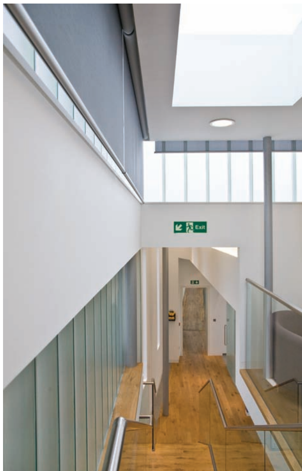
Clockwise from bottom right: The view from the top of the showpiece staircase; the X-ray room; one of the surgeries housed at the Advance Dental Clinic. All the surgeries incorporate steriwalls, which have improved from those in the original clinic to include a purpose-made Corian sink set into the glass worktop, with a MISCEA tap activated by sensors that also dispense soap and disinfectant