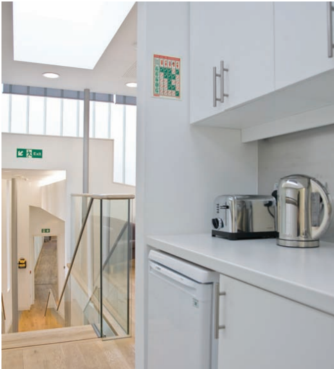
Left, top left, top right: The kitchen is adjacent to the staff room, which is also used as the training area for the courses offered by the clinic Bottom left: The view from the staff room of the 'planted' roof, which supports solar hot-water panels